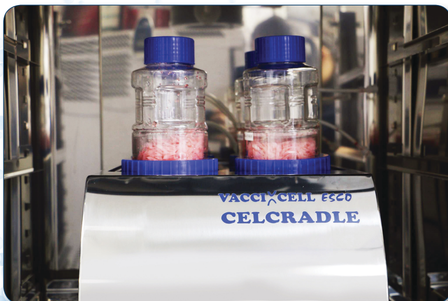
Image 3: The CelCradle-500AP bottle is designed to fit into a standard CO 2 incubator (constant temperature and gas control).

This Application Note describes a general protocol for the first CelCradle optimization run to produce a hybridoma culture containing a mixture of monoclonal antibodies. Each hybridoma clone will exhibit different growth characteristics and production lifetimes, ranging from days to years.